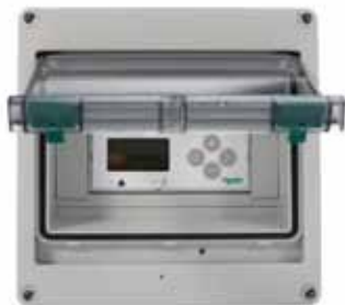
EM3500 in enclosure with door open