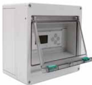
EM3500 in enclosure with door open